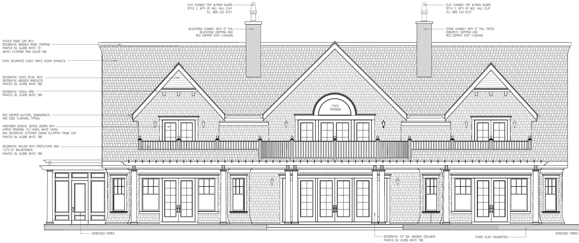
2 EAST ELEVATION SCALE: 1/4" = 1'-0"